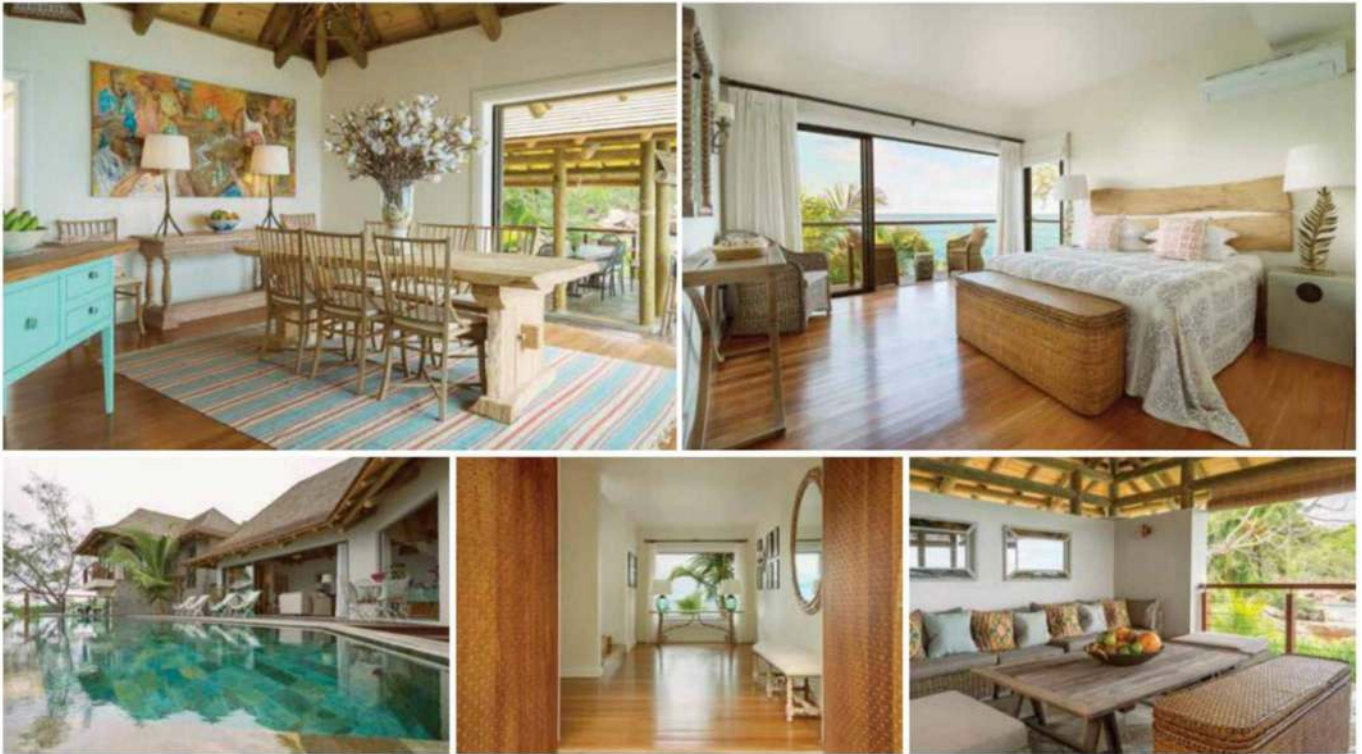
Seamonkey - Seychelles